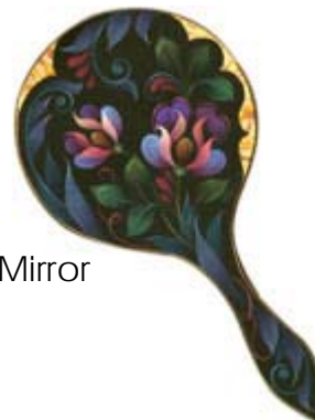
#666 Jacobean Mirror