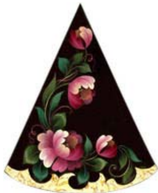
#664 Strokework Peonies

These new packets are now on my web site, each one is just $10.95: