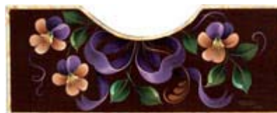
#665 Strokework Wild Pansies